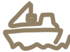
Grain and feedstuff handling and merchandising