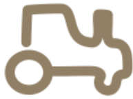
Products and services for farming

The Group's activities are subdivided into main four operating Segments. Division into separate Segments is dictated by different types of products and character of related activities; however, activities of the Segments are often interconnected.