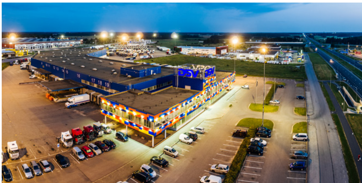
DSV logistics center in Tallinn