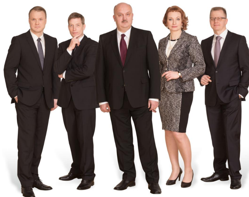
The Management Board of Latvenergo AS

Additional information in Sustainability and Annual Report, pages 13, 17