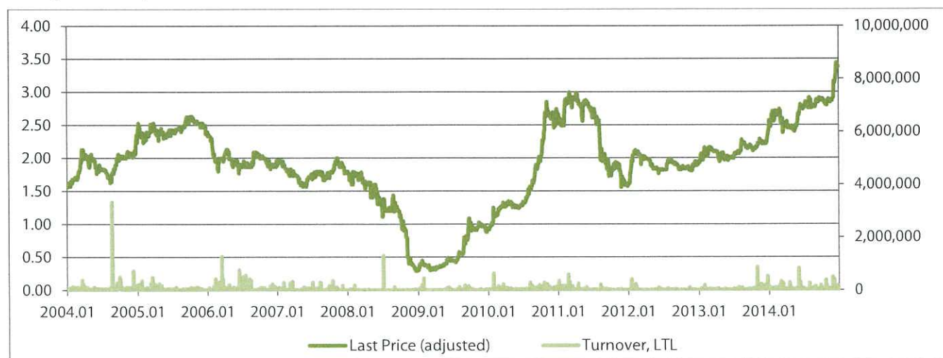
9.2. figure. Share price and turnover 01.01.2004 – 31.12.2014.