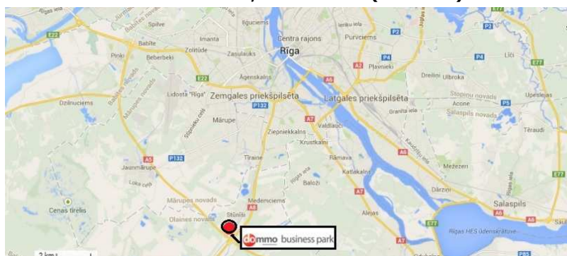
Real estate objects owned by group companies of INVL Baltic Real Estate, AB in Riga (Latvia)