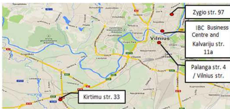
Real estate objects owned by group companies of INVL Baltic Real Estate, AB in Vilnius (Lithuania)